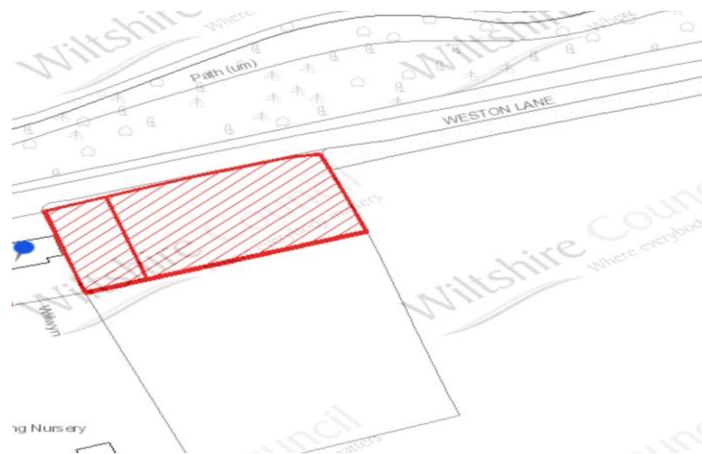
Site outlined in red

In planning policy terms the site lies within the countryside outside of the housing policy boundary (defined limits of development) of Winterslow. The site also lies within a Special Landscape Area (saved local plan policy C6 refers).